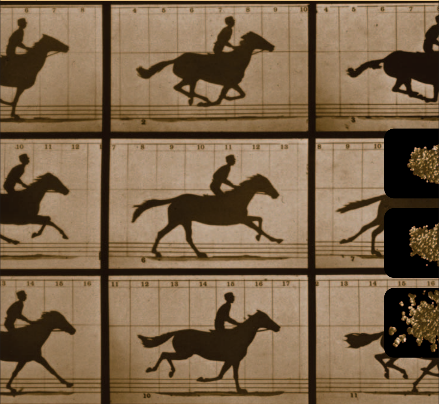
Detail of "Sallie Gardner" Running at a 1:40 Gait, June 1878, from the series The Horse in Motion. Albumen print (cabinet card) 10.3 x 20.7 cm Iris & B. Gerald Cantor Center for Visual Arts at Stanford University, Stanford Family Collections, 13926.4 Used with permission.