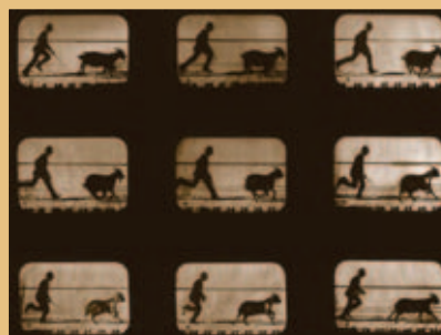
Goat Running, Chased by Man Wielding Stick, 1879, plate 88 from the series Attitudes of Animals in Motion Printing-out paper print, published by Eadweard Muybridge in 1881 16 x 22.4 cm Special Collections, Stanford University Libraries, RBC.TR140.M93.f.88 Used with permission.

says. “Can you understand how a structure absorbs light energy and generates chemical energy or fuel? Can you make a molecule that is a photocatalyst for the generation of hydrogen gas that can be used as car fuel?”