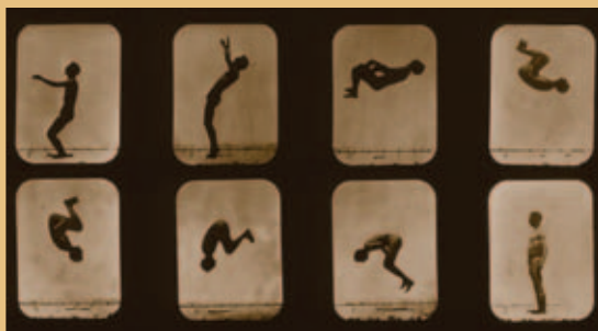
Athlete, Backwards Somersault, 1879, plate 104 from the series Attitudes of Animals in Motion Printing-out paper print, published by Eadweard Muybridge in 1881 16 x 22.4 cm Special Collections, Stanford University Libraries, RBC.TR140.M93.f.104 Used with permission.