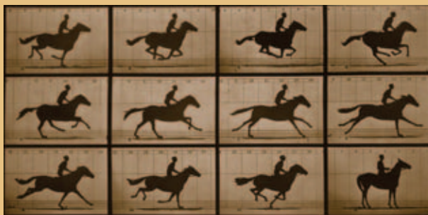
"Sallie Gardner" Running at a 1:40 Gait, June 1878, from the series The Horse in Motion. Albumen print (cabinet card) 10.3 x 20.7 cm Iris & B. Gerald Cantor Center for Visual Arts at Stanford University, Stanford Family Collections, 13926.4 Used with permission.

workhorses for drug development, environmental clean up, and computing advances. However, some scientists are looking beyond the known applications.